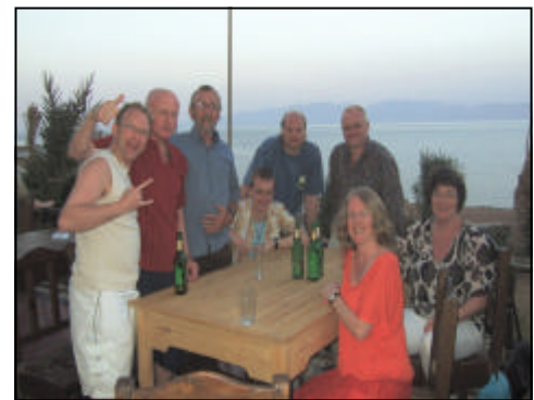
But we enjoyed this as well !!